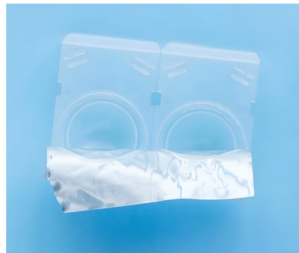
Example of Easy Peel Retort Film for Lidding Film