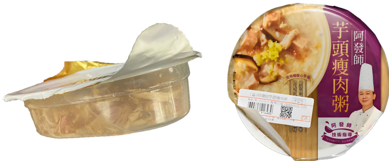
Example of Easy Peel Retort Film for Lidding Film